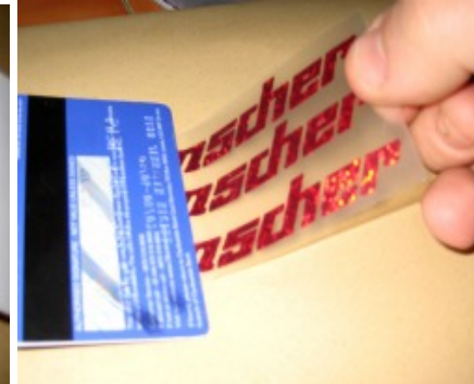
YOUR LEFT WITH STICKY DECAL – STICK ONE EDGE DOWN FIRST