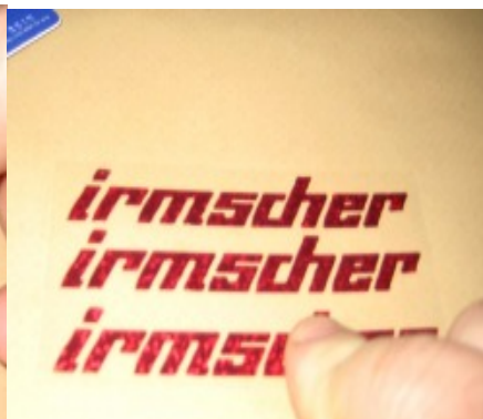
KEEPING TENSION IN ONE HAND – APPLY WITH CREDIT CARD