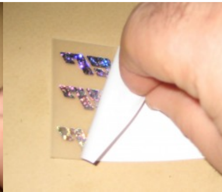
STICK TRANSFER FILM TO FRONT – PEEL OFF BACKING PAPER